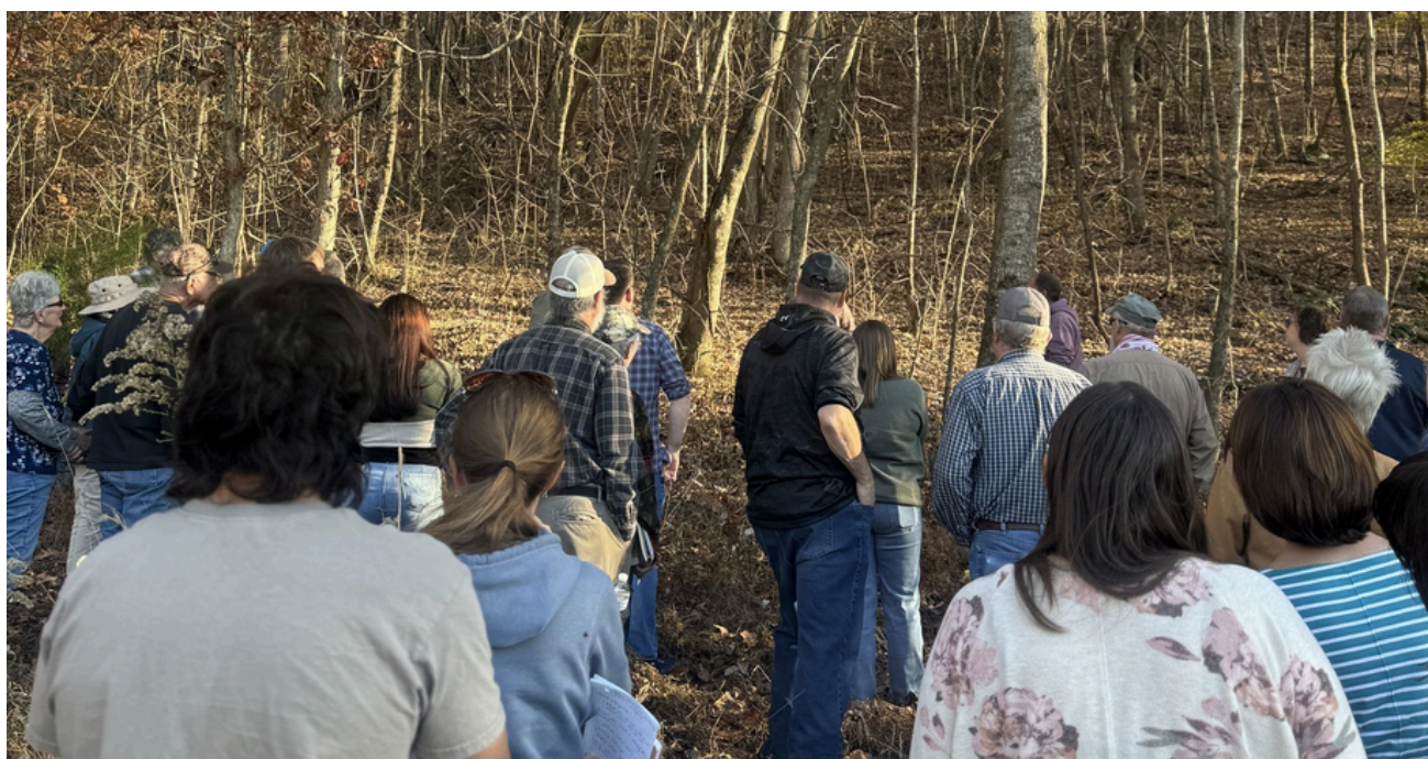
Above: Maple School participants learn from technical assistance providers at the event in Blountville.

The event drew forty attendees and featured hands-on demonstrations at Maple Grove Farm of Afton, as well as presentations from industry experts and university faculty. Other topics included equipment for small-scale production, sap collection and storage, alternative tree syrups, forest management, and cooking with maple products.