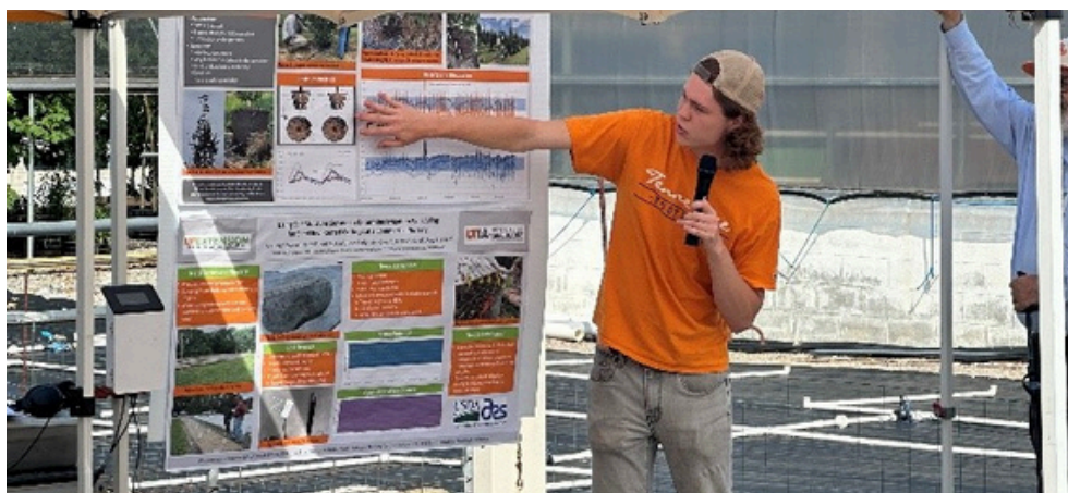
Bottom: Presentations on relevant industry topics were provided by UT Extension and UTIA personnel at the Green Industry Field Day.