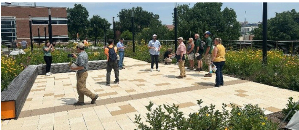
Top: Green Industry Field Day participants on UT campus.

The program consisted of three guided walking tours in the UT Gardens followed by a series of presentations from UTIA personnel and industry leaders in the afternoon. Program presentations centered on an economic update of the green industry, soil microbial health, labor challenges, and a panel discussion on the turf industry.